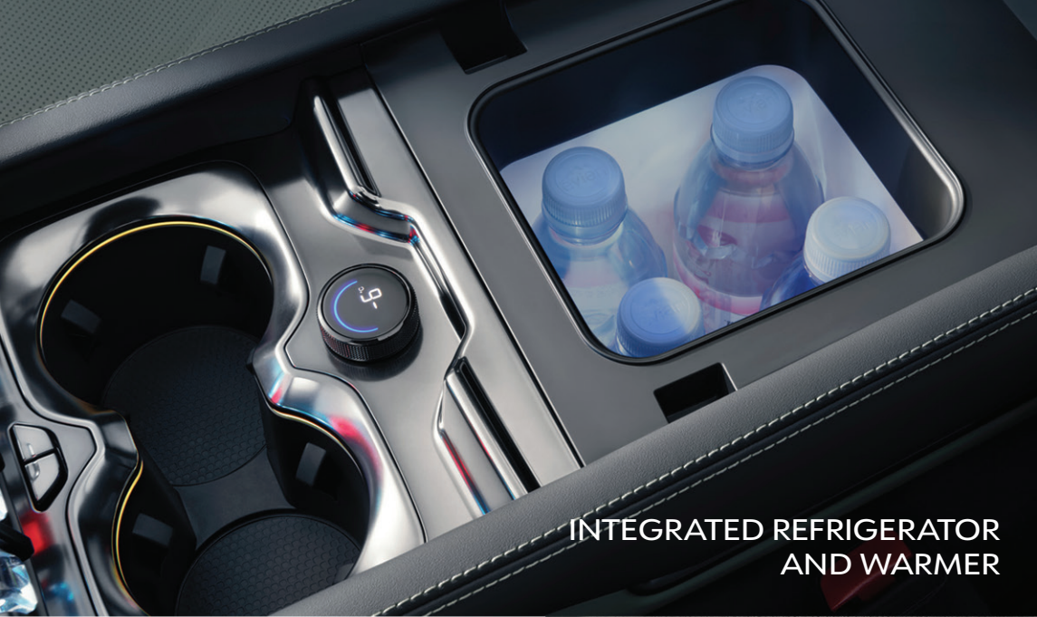
INTEGRATED REFRIGERATOR AND WARMER