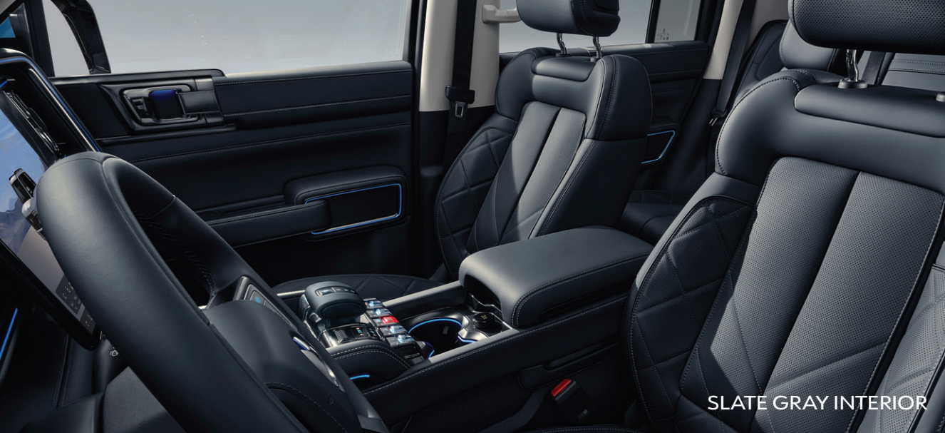
SLATE GRAY INTERIOR