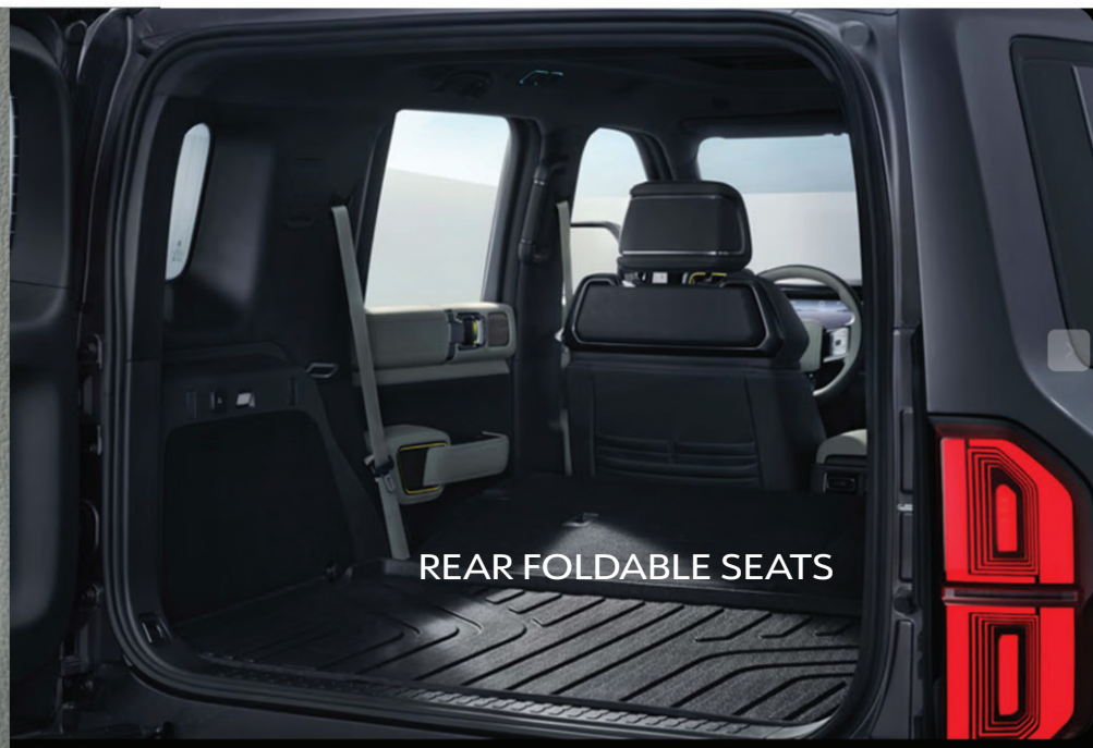
REAR FOLDABLE SEATS