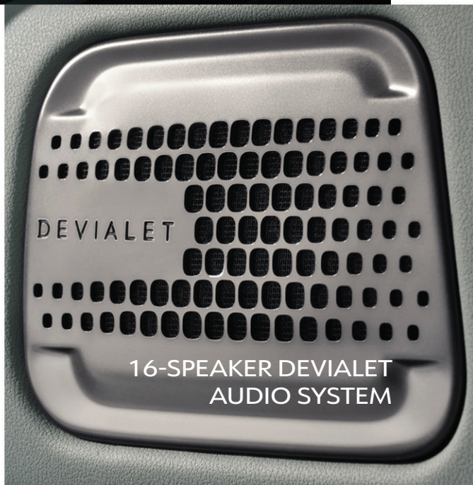
16-SPEAKER DEVIALET AUDIO SYSTEM

Keep essentials perfectly stored on the go with the Integrated Refrigerator and Warmer. Designed for seamless access and optimal temperature control, it ensures your beverages and food stay how you want them- whether chilled or warm- through every journey.